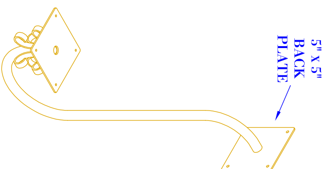
ISOMETRIC VIEW (NTS-BRACKET ONLY)