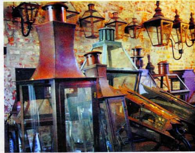
GAS LANTERNS HAVE ILLUMINATED NEW ORLEANS SINCE THE 1700S.

What transforms the lanterns from mere street lamps to handcrafted pieces of utilitarian art is the unmatched method of construction. Coppersmiths trained in traditional metalwork create the lights. "We still have craftsmen who install copper rivets