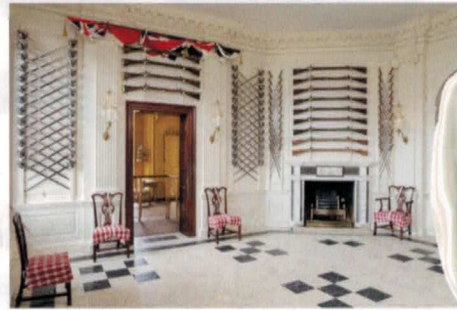
LEFT: The Governor's Palace. BELOW: Benjamin Moore's Prentis Cream. benjaminmoore.com .

For years, the entrance hall of the Governor's Palace at Virginia's Colonial Williamsburg was dominated by dark walnut paneling. But recent scholarship suggested that a period display of arms would have been set against a light background. Experts were consulted, Benjamin Moore's Prentis Cream was selected, and voilà: a once-dark, foreboding space now feels surprisingly of-the-moment—a triumph of timelessness. colonialwilliamsburg.com .