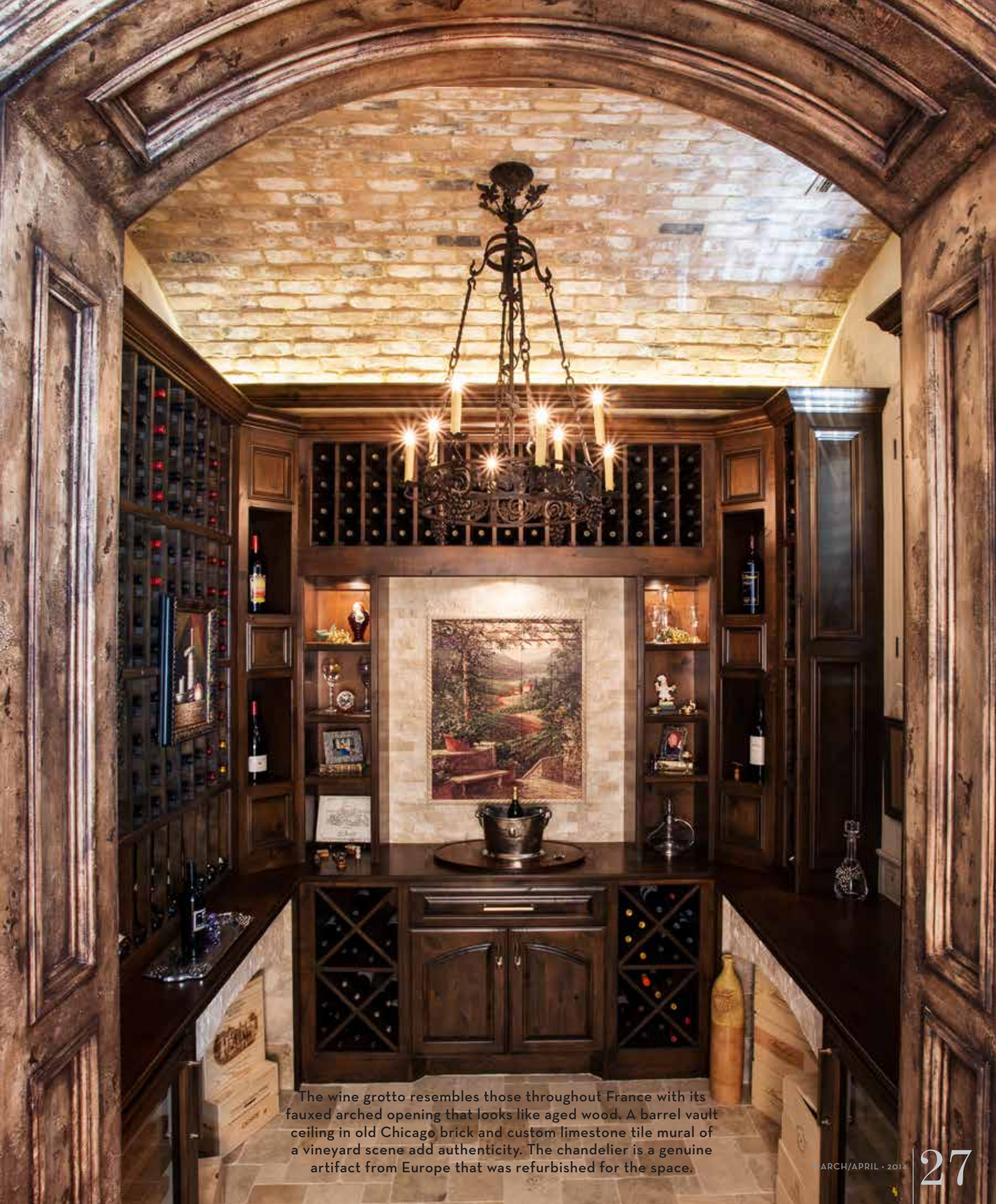
The wine grotto resembles those throughout France with its fauxed arched opening that looks like aged wood. A barrel vault ceiling in old Chicago brick and custom limestone tile mural of a vineyard scene add authenticity. The chandelier is a genuine artifact from Europe that was refurbished for the space.