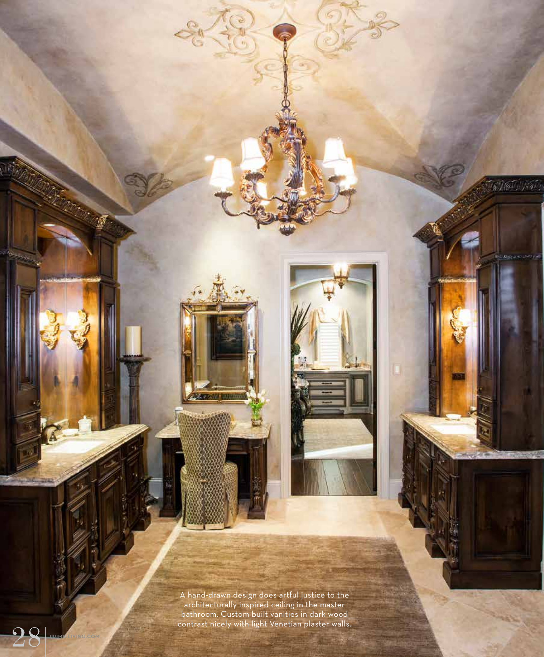
A hand-drawn design does artful justice to the architecturally inspired ceiling in the master bathroom. Custom built vanities in dark wood contrast nicely with light Venetian plaster walls.